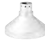
WV-QSR501-W Mount Bracket