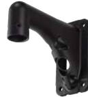
WV-QWL501-B Mount Bracket