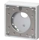
WV-QIB500-W Mount Bracket