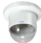
WV-QCD100C-W Dome Cover