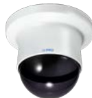
WV-QCD100G-W Dome Cover