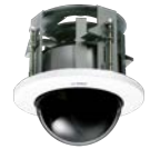
WV-QED100C-W Ceiling Mount Bracket