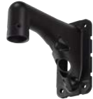
WV-QWL501-B Mount Bracket