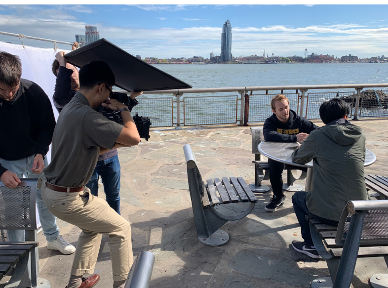
SVA is making the AU-EVA1s available to advanced students to shoot outside projects.

“The EVA1 – so similar to the higher-end VariCams – is a genuine bridge to motion picture production practice, a real introduction to state-of-the-art cinema tools”