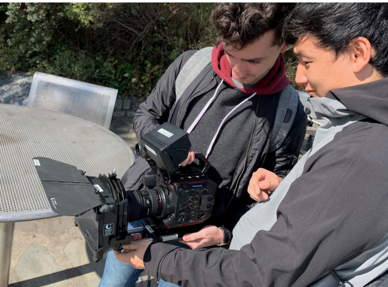
AU-EVA1s are allocated to all cinematography and production classes for second- and third-year BFA Film students.