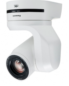
The AW-UE150 integrated 4K/HD PTZ camera features a 4K/UHD 60p video output and a wide 75.1-degree viewing angle.